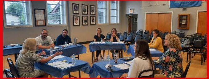
Members of the District Advisory Council incorporate information from annual evaluation graphs and parent comments into the revised district policy for the following school year.

If the system plan for Title I, Part A, developed under ESSA, is not satisfactory to the parents and families of participating children, the school district will submit any parent and family comments with the plan when the school district submits the plan to the State Department of Education. Each policy requests such input. The system policy has an attached cover sheet requesting input.